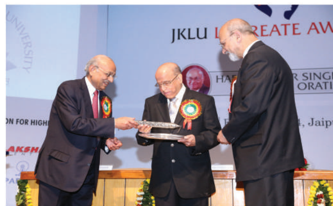
Dr. K. Kasturirangan, former Member of Rajya Sabha and former Chairman of the Indian Space Research Organisation, receiving the JKLU Laureate Award 2014 from Shri Bharat Hari Singhania, President, JK Organisation & Chancellor, JKLU.